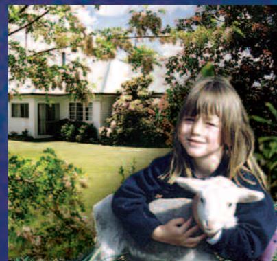
Silent Grove farmstay.