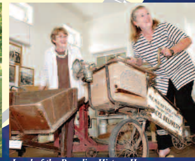
Land of the Beardies History House.