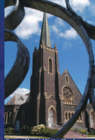
Cameron Memorial Uniting Church.

A leisurely drive around the central area of Glen Innes gives an enduring appreciation of the heart of Celtic Country – the past, lovingly preserved, and current attractions. The tour is facilitated by Tourist Drive signs.