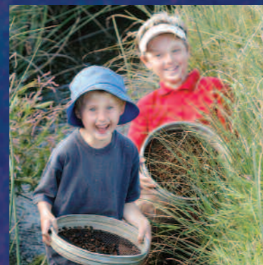
Fossicking - great family fun.