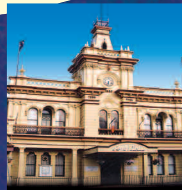
Glen Innes Town Hall.