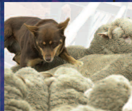
Deepwater - noted for fine wool, beef.