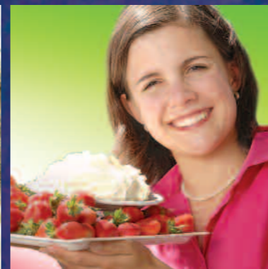
Tempting fruits from the Strawberry Patch.