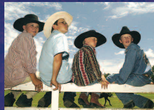
Our villages...all about Country.

Now, 25km from Ben Lomond, left to Grahams Valley Road, further 5km and left to highway for final 14km to Glen Innes.