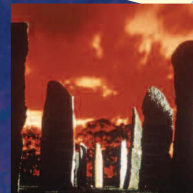
Australian Standing Stones.