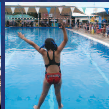
Fun in heated pool.