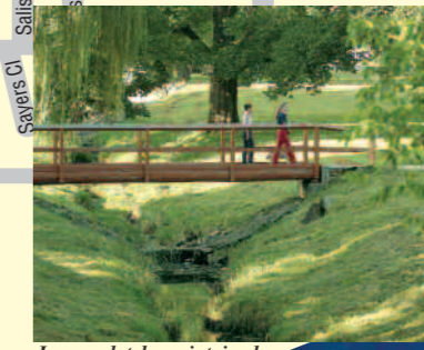
Immaculately maintained parklands.